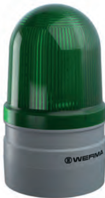
Base mounting with cable exit at side